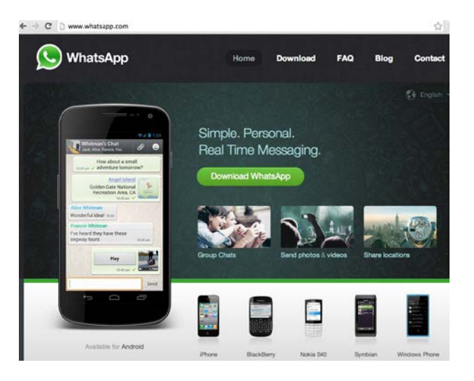
12. Upon information and belief, the following describes, at least in part, how WhatsApp's Messenger app system works:

11. Upon information and belief, the following describes, at least in part, WhatsApp's Messenger app: