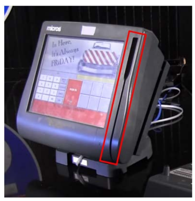
https://www.youtube.com/watch?v=FaYEm6oWY 8, 0:42

21. TGIF's POS terminals receive financial information from a credit or debit card in connection with authorizing a purchase transaction.