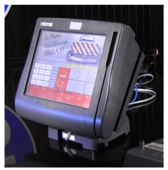
https://www.youtube.com/watch?v=FaYEm6oWY 8, 0:42

21. TGIF's POS terminals receive financial information from a credit or debit card in connection with authorizing a purchase transaction.