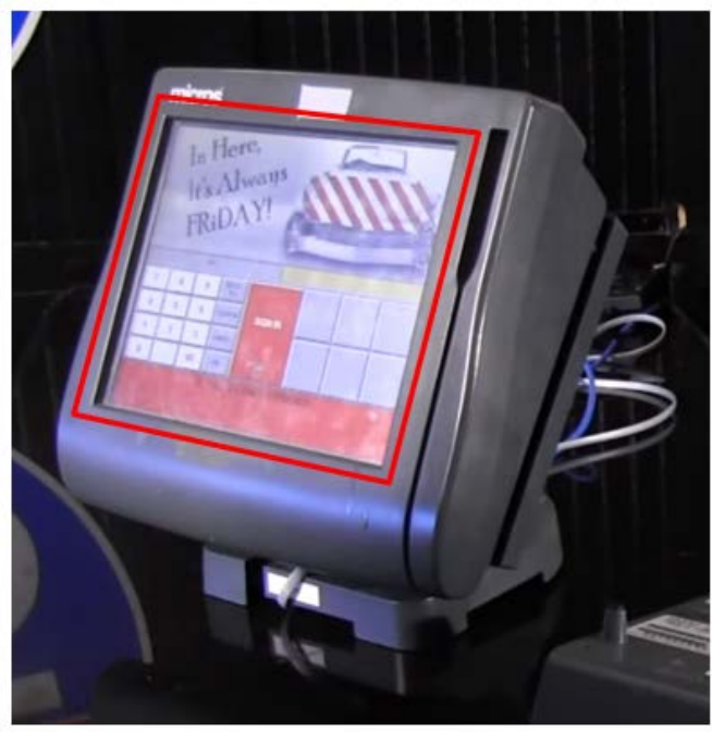
https://www.youtube.com/watch?v=FaYEm6oWY 8, 0:42

22. TGIF's POS devices have an input device (e.g., touchscreen) configured to receive a request for a cash amount in excess of the amount of a purchase transaction (e.g., tip), e.g.: