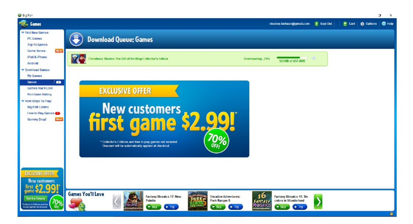
34. Big Fish Games has infringed, and continues to infringe one or more claims of the '229 Patent in the United States during the pendency of the '229 Patent, including at least claims 1-7, 10-13, and 16 by making, using, importing, offering for sale and/or selling the Big Fish Games portal which software and associated backend server architecture, inter alia , allow for downloading a first portion of a data file, such as a game, to a file on the user's computer; pausing the download using a "Pause" button during which pause the user's computer is available for other processing operations; and resuming the download by using a "resume" button, thereby allowing a second portion of the game to be downloaded and written to a file on the user's computer.

Case 2:17-cv-00172 Document 1 Filed 03/06/17 Page 13 of 17 PageID #: 13