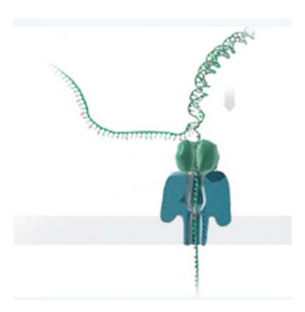
Exhibit 7. As the DNA passes through the hole, it disrupts the electrical current that is passing through the hole, thus producing a signal. To evaluate the sequence, one can attempt to correlate this signal with the DNA bases that are passing through the hole.

15. To sequence DNA using Oxford's products, one first applies a voltage across the membrane such that an electrical current flows through the hole. A strand of DNA is then drawn through the hole: