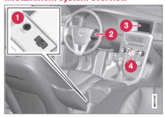
Infotainment system overview